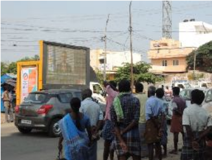
People are viewing the video content from the mobile van