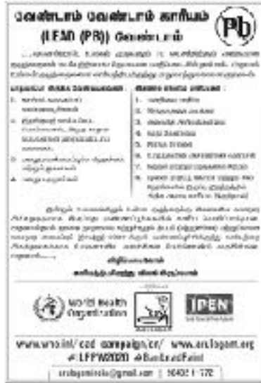
Leaflet 2000 numbers printed and circulated

Flyers (WHO Awareness pamphlets - content translated into 'Tamil' language and it was widely circulated)