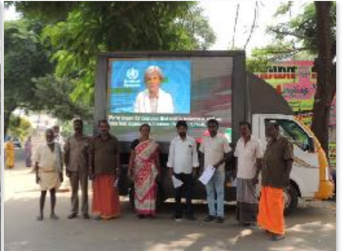
Members from Painters Association gathered