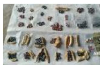
photo 3 Training on bean seed conservation