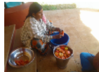
photo 2 Training on seed selection and saving