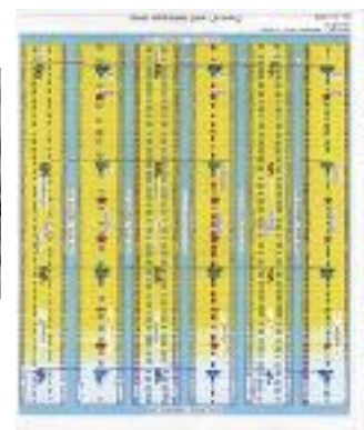
photo 4 one page pictorial training map of Kumaraswamy vegetable model for women gardeners to practice