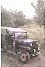
Vehicle operators now have been allowed to enter previously inaccessible places of Mudumalai Tiger Reserve. *ROHAN PREMKUMAR

"Conservationists are of the opinion that these routes that cut through vulture nesting sites and areas,