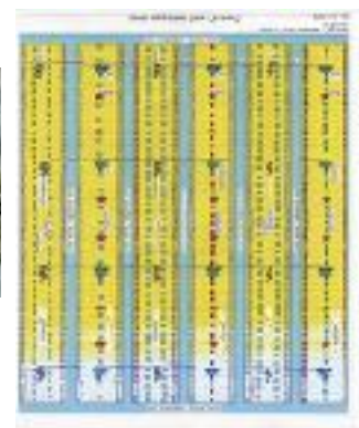
photo 4 one page pictorial training map of Kumaraswamy vegetable model for women gardeners to practice