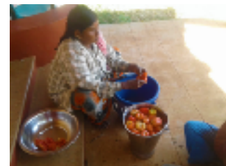
photo 2 Training on seed selection and saving